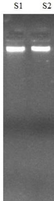
Gel image of high molecular weight DNA extracted from the bacteria isolates