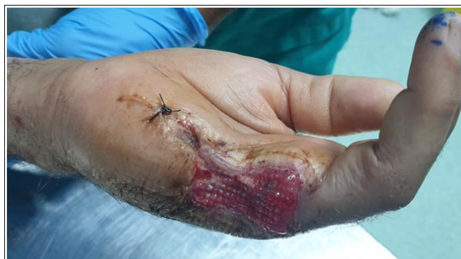
Figure 2: Appearance of the left hand after healing, showing the area of skin loss