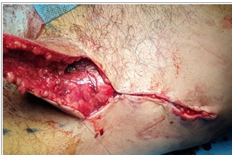
Figure 5: showing intraoperative image of closure of the flap donor area