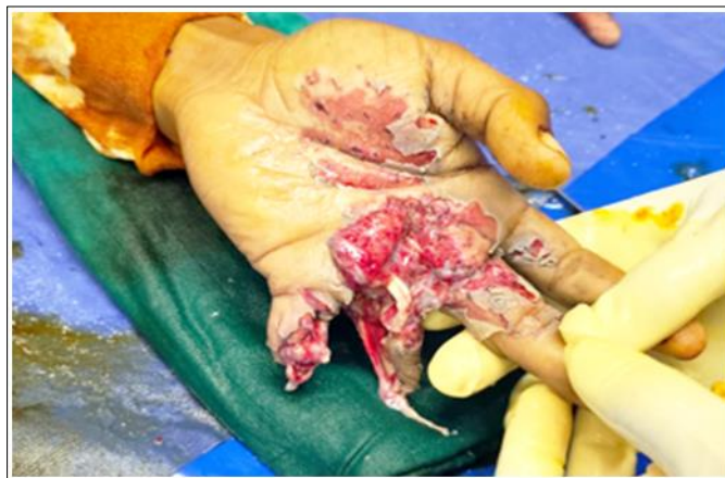
Figure 1: Appearance of the left hand after trauma

The postoperative course was uneventful: 100% flap take, donor site healing in 10 days, no infection. Passive then active rehabilitation began at the 4th week. At 6 months follow-up, the flap was supple, well-integrated, with no significant contracture. The patient returned to his professional activities with technical adaptations.