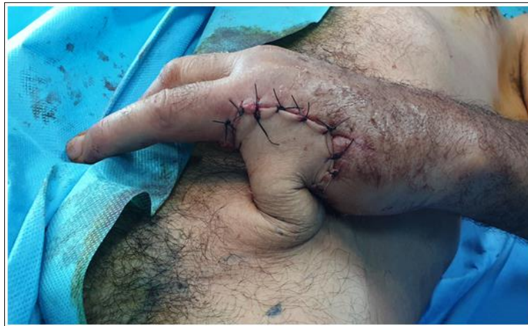
Figure 6: Showing postoperative image after flap transfer and suturing to the defect in the hand