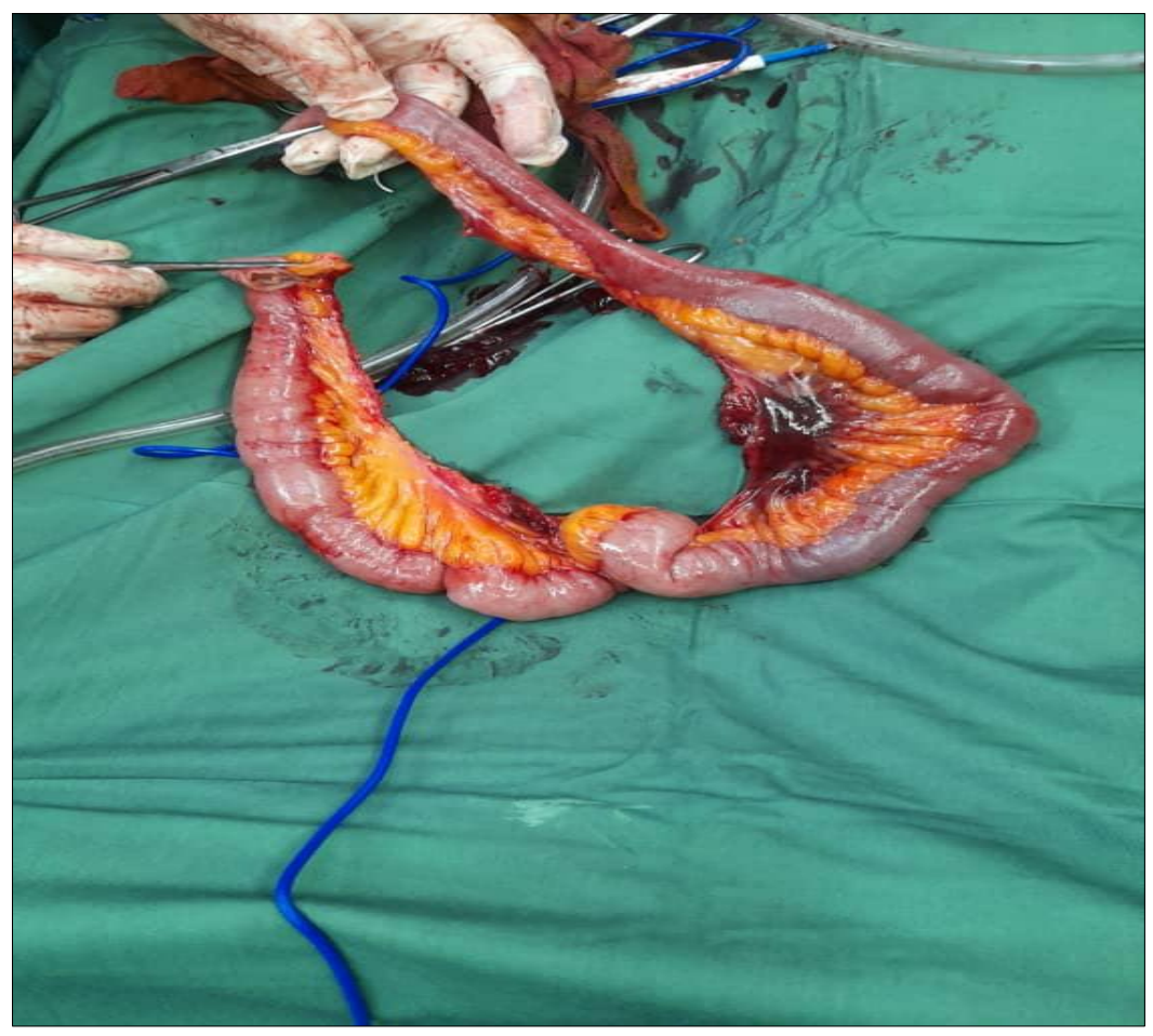
Figure 2: Resection of Ischemic Part

Because of size of damage we decide to do resection ischemic part and do Anastomosis.