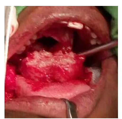
Fig-3: View of tumour's excision