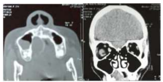
Fig-2: CT Scan of the palatal mass