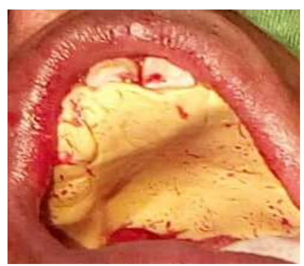
Fig-5: View of silicone palatal plate