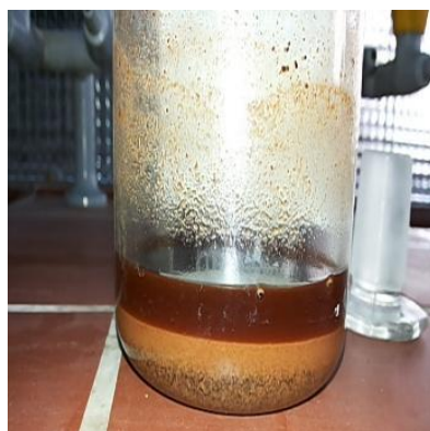
Fig-2: Grape seeds cold maceration