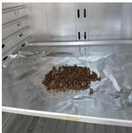
Fig-1: Grape seed drying in oven at 50 C°

Fresh grape fruits ( Vitis labrusca or red, Vitis vinifera or black and Vitis vinifera or Green grape) were collected in the time between Augusts and October 2019. Seeds of black and green grape were collected house garden in Tripoli, while seeds of red grape were collected from local Libyan market. All seeds were manually separated and collected from its fruits, dried in oven at temperature of 50 C° (Figure 1). Grape seeds were weighed continuously until weight is fixed. The dried grape seeds were grinded to powder, weighed, labeled and kept in dry place.