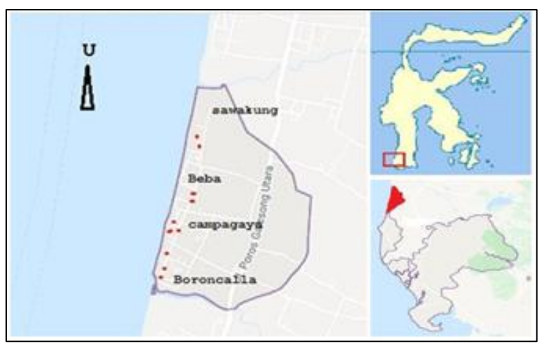
Fig-2: Feces Sampling Location