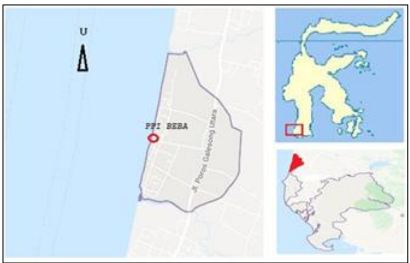
Fig-1: Fish Sampling Location

Distribution of questionnaires and interview process to 30 people in Tamasaju Village were conducted for 2 days at 10.00 - 16.00 WITA. The location of the interview for respondents was only conducted in 4 hamlets, namely; Sawakung Hamlet, Beba Hamlet, Campagaya Hamlet, and Borong Calla Hamlet. This is because only the four hamlets are directly adjacent to the sea.