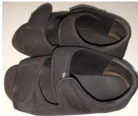
Figure 2. showing the MCP sandals. This is a simple diabetic footwear (Type 1)

Microcellular rubber (MCR) and Microcellular polymers (MCP) sandals (Figure 2) that are made of polyurethane, EVA, etc are simple diabetic footwear which are commonly used in Asian countries like India. Wedged footwear's (Figure 3), half footwear's, rigid rockers, etc are complex footwear whereas the modified molded (customized) are complicated footwear's (Jain, A. K. C. 2019).