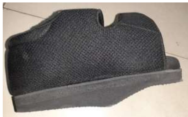
Figure 3. showing the Anterior Ortho-wedge footwear. This is a complex diabetic footwear (Type 2)

This triangle of diabetic footwear can be used as an excellent model both for teaching as well as in