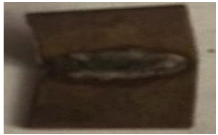
Figure 12: Welded Mild steel A Immersion in 2M HCl after 18 hours exposure time