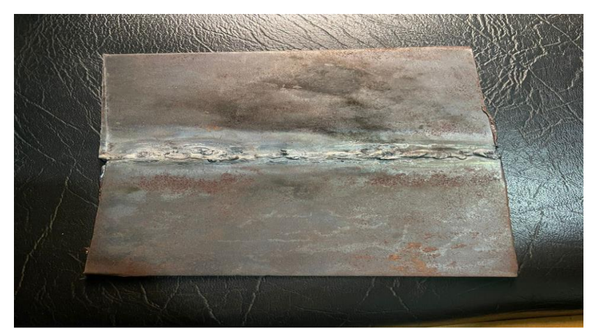
Figure 2: Corrosion Improvement on Welded Mild Stee (Mohammed et al., 2018)

Mild steel found applications in industries due to its excellent mechanical and physical properties, low cost, and ease of fabrication. However, mild steel is highly susceptible to corrosion, which compromises its structural integrity and reduce its lifespan when exposed to the environment, resulting in the deterioration of the metal over time as shown in Figure 2.