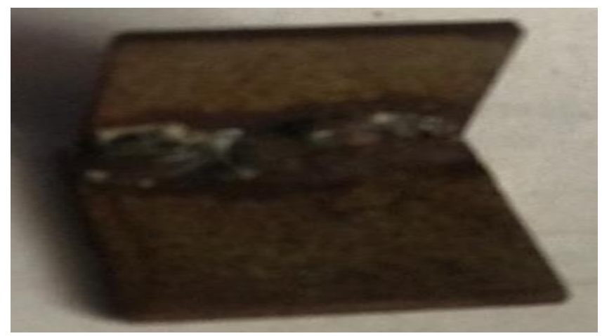
Figure 13: Welded Mild steel B Immersion in 2M HCl after 18 hours exposure time