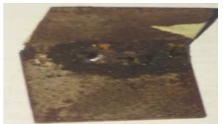
Figure 7: Welded Mild steel sample1 immersed in concentrated HCl after 18 hours exposure time

Corroded welded mild steel specimen at room temperature with and without addition of inhibitor in two HCl solutions was investigated by visual inspection to compare their corrosion rates. After being exposed for eighteen hours, as indicated from Figure 7 to Figure 14, the examined corroded sample is displayed on plates 4.1, 4.2, 4.3, 4.4, 4.5, 4.6, 4.7, 4.8, 4.9, and 4.10. It is submerged in a concentrated HCL and diluted HCL (2M) solution with 0.5 g/l, 0.3 g/l, and 0.1 g/l concentrations of the AASE inhibitor as contained in Awe et al. , (2015).