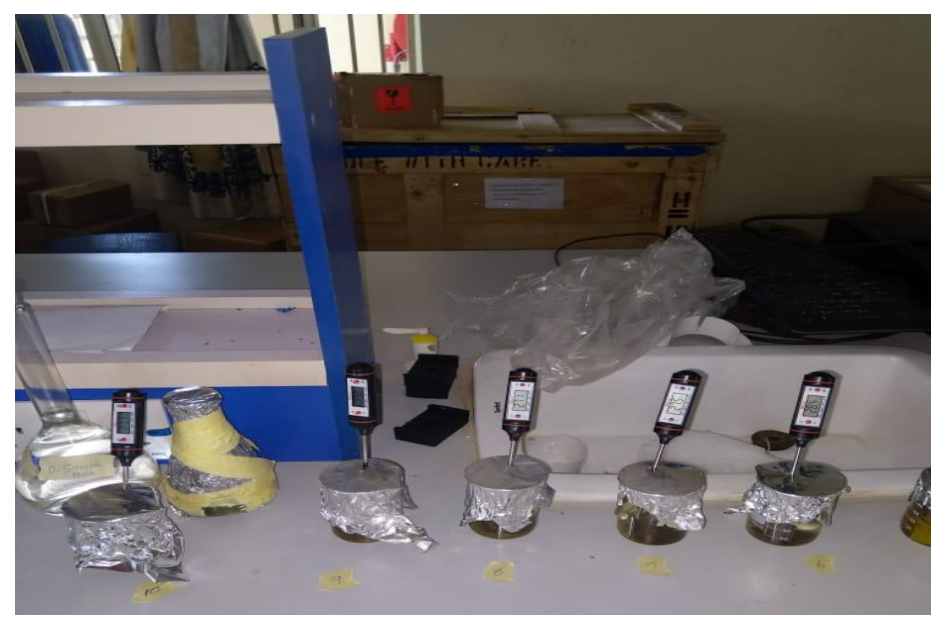
Figure 4: Experimental Setup of Thermometric Measurement

The thermometric measurement is obtained from the experimental set-up shown in Figure 4.