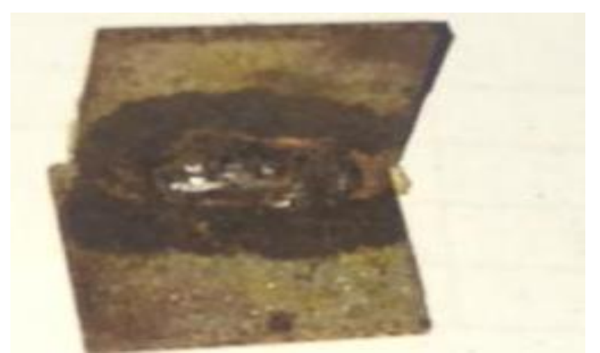
Figure 9: Welded Mild steel Immersion in concentrated HCL with 0.1g/l concentration (AASE inhibitor after 18 hours exposure)