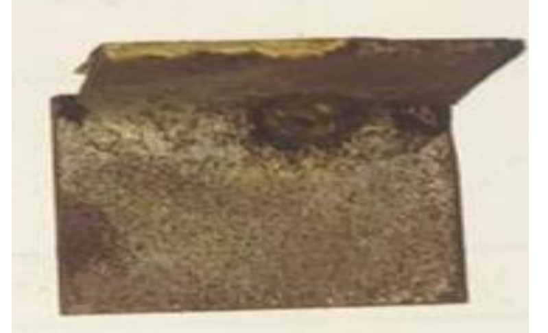
Figure 8: Welded Mild steel sample2 immersed in concentrated HCl after 18 hrs exposure time