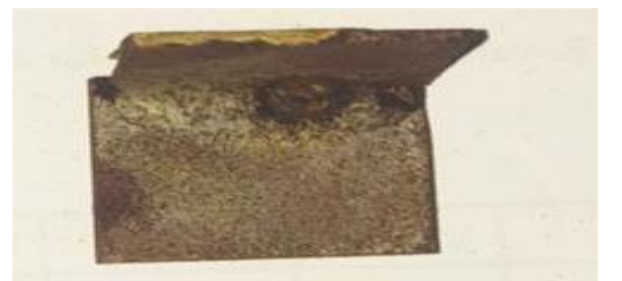
Figure 14: Welded Mild steel Immersion in 2M HCl solution with 0.1g/1 concentration