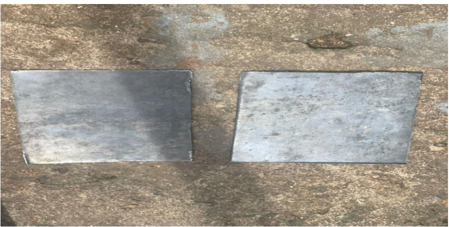
Figure 3: Surface Smoothening

The mild steel utilized in this work is welded, mechanically cut to dimensions of 2.0 \ge 0.2 \ge 2.5 \le 10^{-1} cm (a surface area of 11.8 \le 2.5 \le 10^{-1} ), and shined using an emery paper range of 400 to 1200 grades. As seen in Figure 3, the sample's surface was smoothed down by grinding it in a grinding machine.