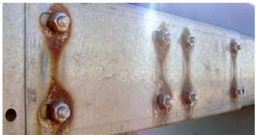
Figure 1: Effects of Corrosion on Mild Steel (Marder, 2018)

In engineering, corrosion is a big problem that may have a big impact on mild steel. There are different kinds of corrosion that can happen, including galvanic, uniform, pitting, and corrosion in crevices. A number of variables, including the metal's composition, temperature, exposure duration, and environment, can affect the kind of corrosion. Mild steel is particularly susceptible to corrosion due to its composition, which contains a high proportion of iron as shown in Figure 1.