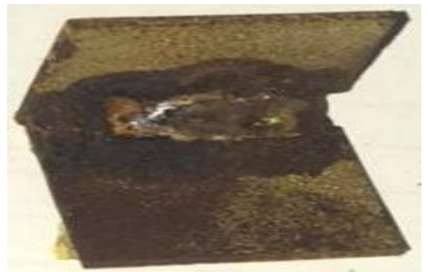
Figure 11: Welded Mild steel sample immersed in concentrated HCL with 0.5g/l concentration