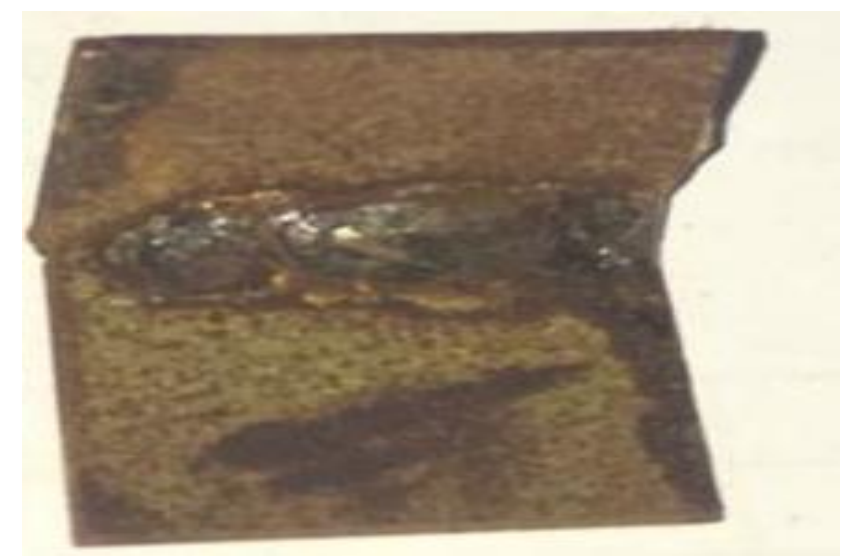
Figure 10: Welded Mild steel Immersion in concentrated HCL with 0.3g/l concentration