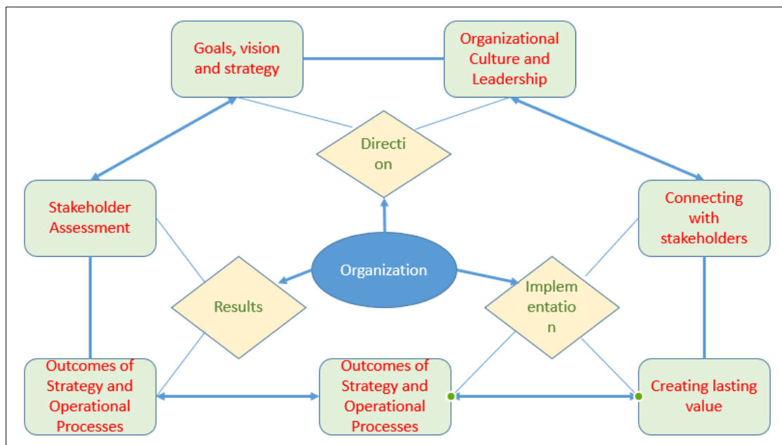
Diagram 2: Structure of the EFQM model version 2020 (EFQM, 2019)