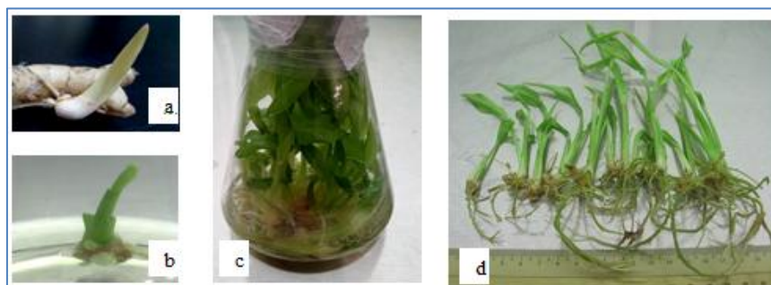
Fig-2: In vitro micropropagation of C. aeruginosa in liquid medium. (a) Healthy sprouted buds from rhizome (b) Sterilized nodal segment after 5 days on MS media without PGR. (c) Multiple shoots formation in MS liquid medium after 8 weeks of cultivation on MS medium supplemented with BAP (4mg/L). (d) Healthy plantlets ready to be acclimatized.

However, on lowering the concentration of BAP from their optimum concentration the number of shoots per explant was reduced. In general, the number of shoots per explant increased to a certain concentration and declined with the increase or decrease in concentration of cytokinin beyond their optimal level. Reduction in shoot number at concentrations higher or lower than optimal level has also been reported for several medicinal plants [13-15]. Higher concentrations of BAP not only reduced the number of shoots formed but also resulted in stunted growth of the shoots. No abnormality such as hyperhydricity and fasciated shoots was observed on shoots produced using liquid medium (Fig 2d). The regenerated shoots were washed thoroughly and placed in a mixture of sterilized vermiculite and sterilized soil (1:1) before acclimatized in greenhouse.