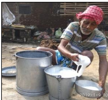
Fig-1: Unhygienic handling of milk