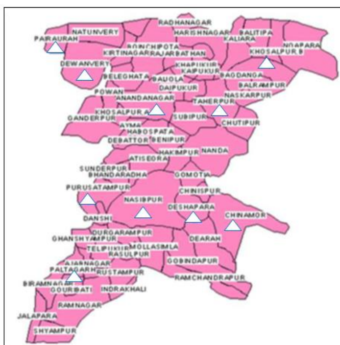
Map of Singur showing 64 revenue villages and sampling area of 10 villages represented by triangle

A total of 100 livestock owners were selected randomly in and around Singur region. Multistage random sampling technique was used to select the respondents. Singur block was purposively selected for the study. From the selected block, a list of villages with maximum populations of milch animals was identified. Out of the list of identified villages, ten villages were randomly selected for the study. From each selected villages 10 farmers were selected randomly thus making a total of 100 farmers. Each farmer were interviewed with a questionnaire containing both open and close ended questions on various aspects of clean milk production. A total of 21 questions were framed to assess the knowledge, attitude and practices on clean milk production. The data was collected and results were analyzed using simple statistical methods.