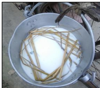
Fig-2: Contaminated milk