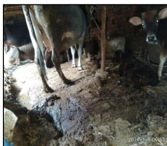
Fig-3: Improper management of cattle shed