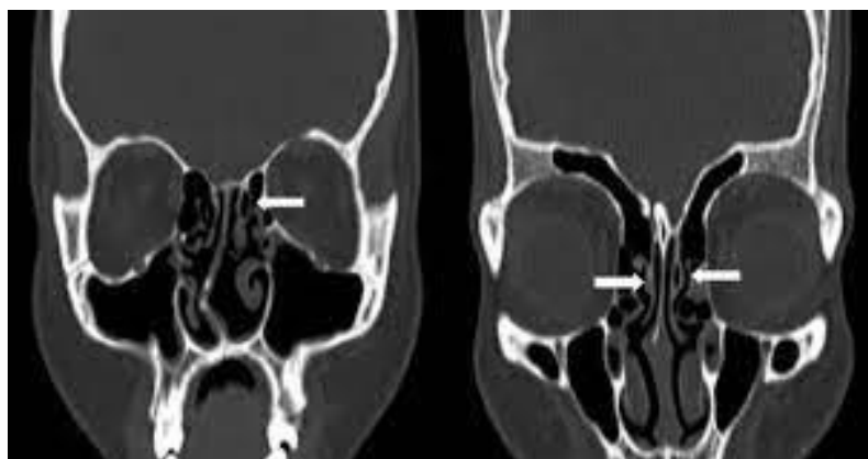
Figure 1: Computed tomography scans showing concha bullosa. (a) unilateral concha bullosa and (b) bilateral concha bullosa