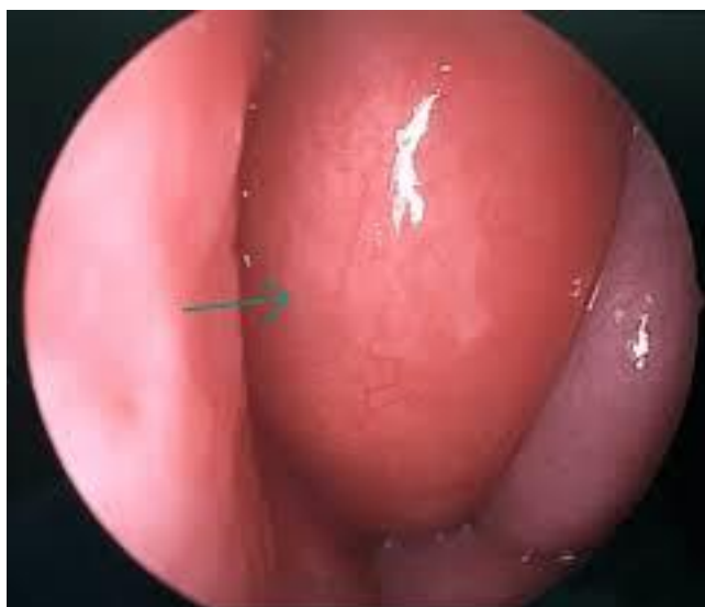
Figure 2: Endoscopic picture showing concha bullosa

All procedures performed in the study were in accordance with the ethical standards of the institutional and/or national research committee. Data was collected and tabulated in an excel sheet. Results presented as proportions and percentages. Chi square test was applied for qualitative data. A p value